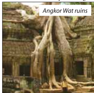
Angkor Wat ruins

For a single room, there is an additional cost of $525.